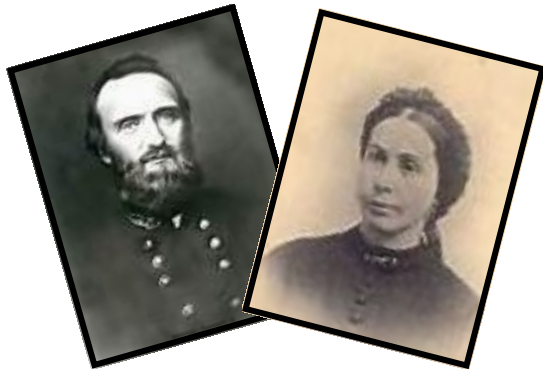
“Stonewall” and Mary Anna Jackson