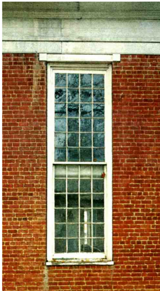
24 over 24 pane window

As the constitution of the Monroe County Historical Society states,